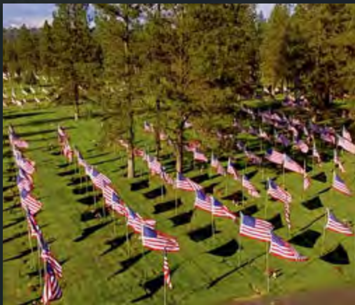
Fairmount Memorial Park

More than 3,800 flags stand guard throughout our cemeteries every Memorial Day Weekend to honor our veterans. Each flag has the veteran's name and the exact position of their memorial in our cemeteries.