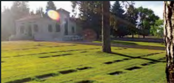
Lawn at Riverside Memorial Park.