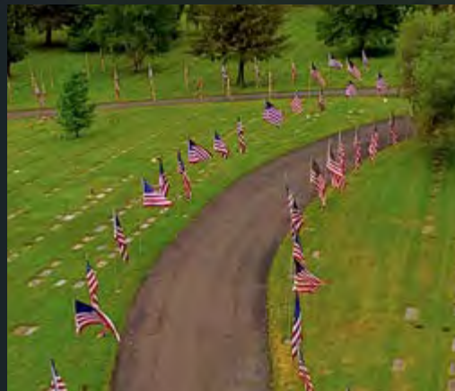
Riverside Memorial Park