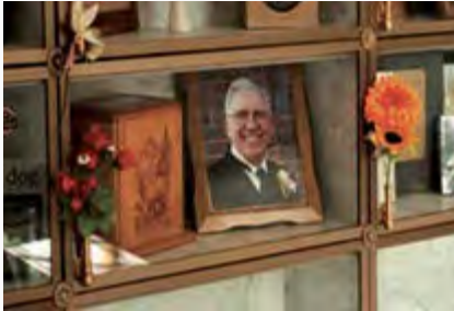
A glass front niche.

Niches for urn placement (called a columbarium ) are often located within a mausoleum, chapel or on cemetery grounds.