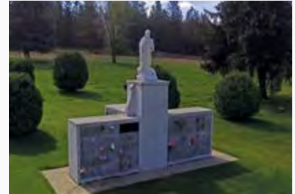
Niches at Spokane Memorial Gardens.