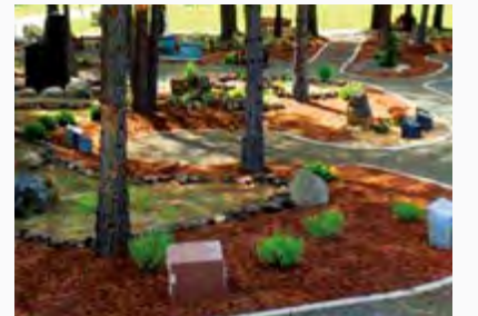
Peaceful Pines Cremation Path at Greenwood Memorial Terrace.