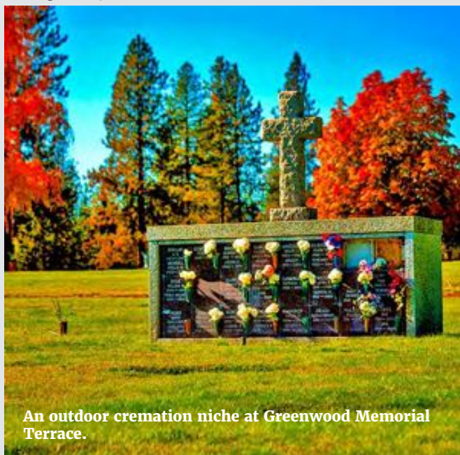
An outdoor cremation niche at Greenwood Memorial Terrace.

When cremated remains of a loved one are kept with relatives, they can easily become misplaced or discarded through the years.