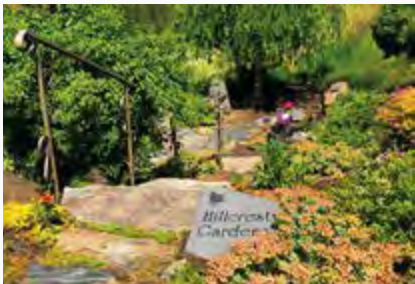
Hillcrest Gardens at Fairmount Memorial Park.

A dedicated section of a cemetery designed for the burial, scattering or other permanent placement of cremated remains.