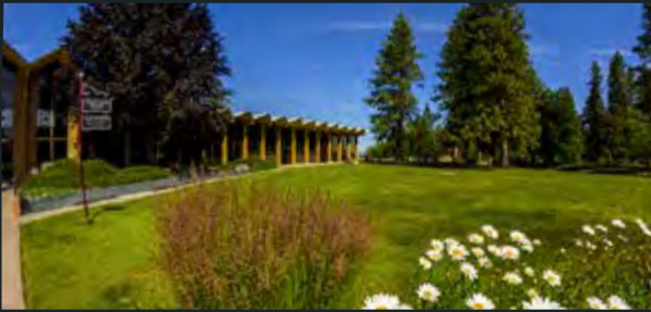
Sunset Chapel & Mausoleum at Fairmount Memorial Park.