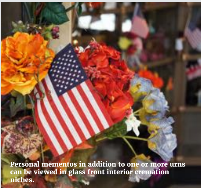
Personal mementos in addition to one or more urns can be viewed in glass front interior cremation niches.

A permanent placement provides future generations with a location to visit when researching heritage.