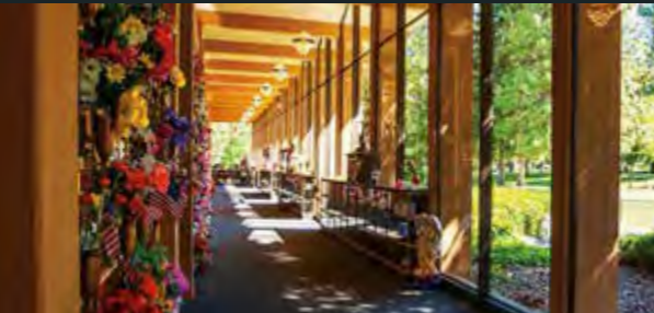
The interior at Sunset Chapel & Mausoleum.