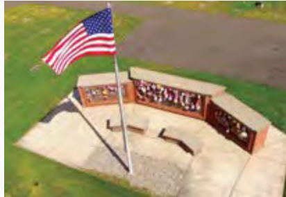
Exterior niches at Pines Cemetery.