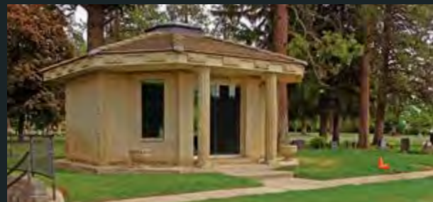
A private family mausoleum is a small structure that provides above-ground entombment of, on average, two to twelve family members.