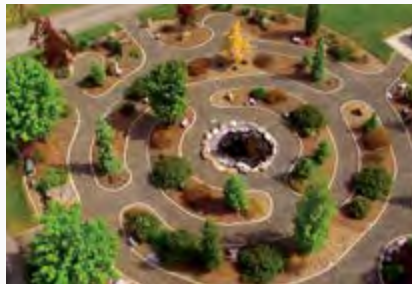
Cremation garden at Pines Cemetery.