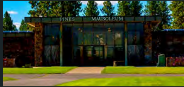
Pines Mausoleum in the Spokane Valley.