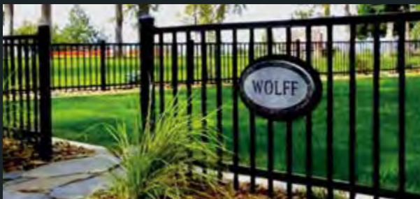
A private estate on the grounds at Fairmount Memorial Park.