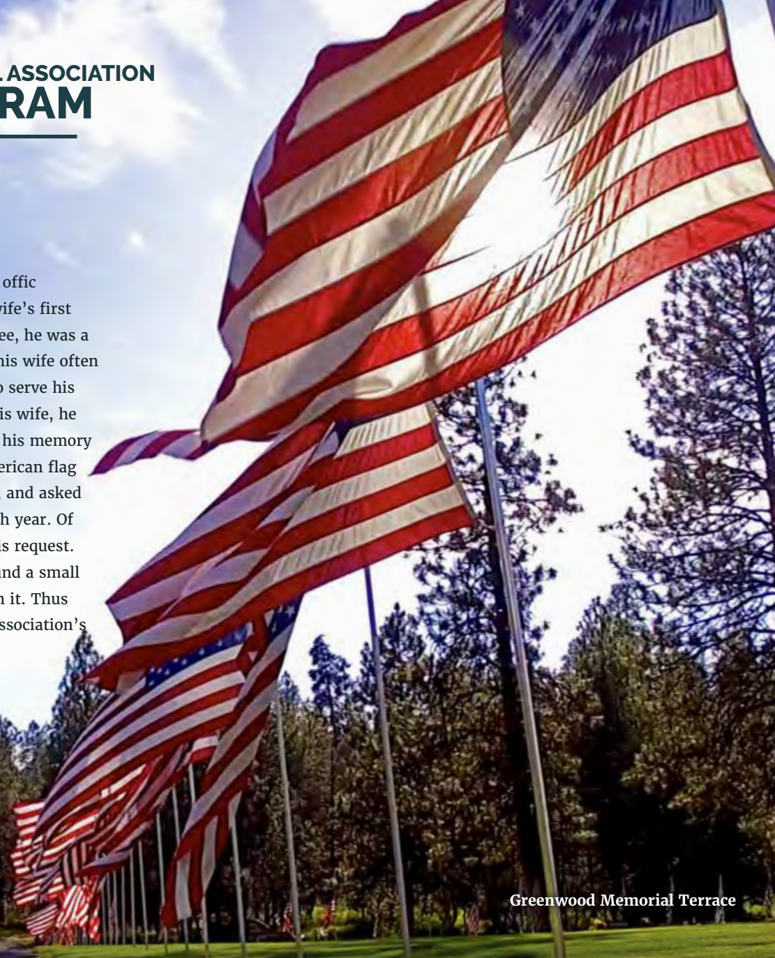
Greenwood Memorial Terrace

In 1971, a gentleman came to our office and asked if he could honor his wife's first husband who passed away. You see, he was a veteran who had passed on, and his wife often talked about how proud he was to serve his country. Because he truly loved his wife, he wanted to help her pay tribute to his memory and service by having a large American flag fly every Memorial Day Weekend, and asked if the cemetery would do that each year. Of course we were proud to honor his request. He purchased the flag, the pole, and a small plaque with the veterans name on it. Thus began the Fairmount Memorial Association's Flag Program.